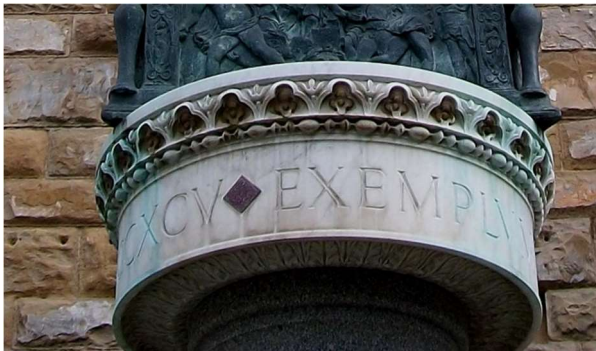
Fig. 17 Donatello, Judith and Holophernes, 1455-1457/ 1460? Inscription from 1495. Florence, Palazzo Vecchio.