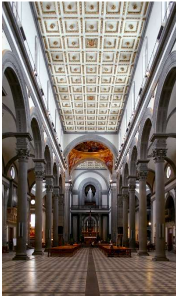
Fig. 10 The central nave of S. Lorenzo.

Cosimo's monument was built in front of the high altar of S. Lorenzo, with a multi-coloured (imperial porphyry, white marble, green serpentine and bronze) arrangement featuring two inscriptions placed in classicising tabulae ansatae , on the one hand, and in the crypt below, on the other, where a sarcophagus with an inscription seems to carry out the same function of sustaining the church as Cosimo's parents' monument and actual burial place did. 27 Cosimo had furthermore secured exclusive burial rights in the central nave, thus maximising the visibility of the upper part of his monument. 28 Upon the Republican revolution of 9 November 1494, when the Medici were exiled from Florence, part of the upper inscription ( decreto publico // pater patriae , by public decree, father of his country), suffered a damnatio memoriae , only to be restored on the return of the Medici in 1512, again eliminated in 1528 and restored after their definitive return in 1530. 29