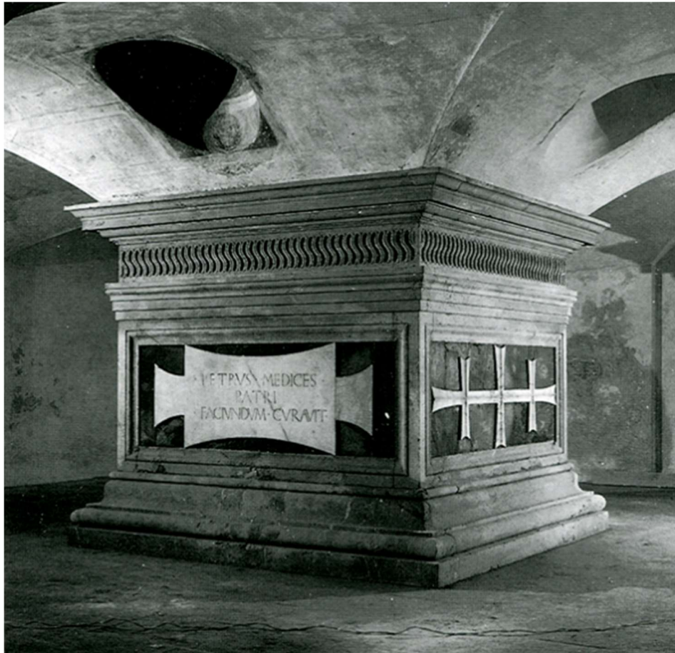
Fig. 11 The subterranean part of Cosimo the Elder's tomb.

The lower part of the monument, supporting the central nave floor, is a sarcophagus with an inscription on a tabula ansata : PETRVS MEDICES // PATRI// FACIENDVM CVRAVIT (Pietro de' Medici had [this monument] made for his father). 30 The spacing is relatively regular and the lettering consists of regular capitals with an attempt at shading through thicker lines but without serifs. 31 As in Giovanni di Bicci's and Piccarda di Edoardo's inscriptions, there is a high M (l. 1), but also, more classically, an M with the central strokes touching the base line (l. 3). Consequently, and expectedly,