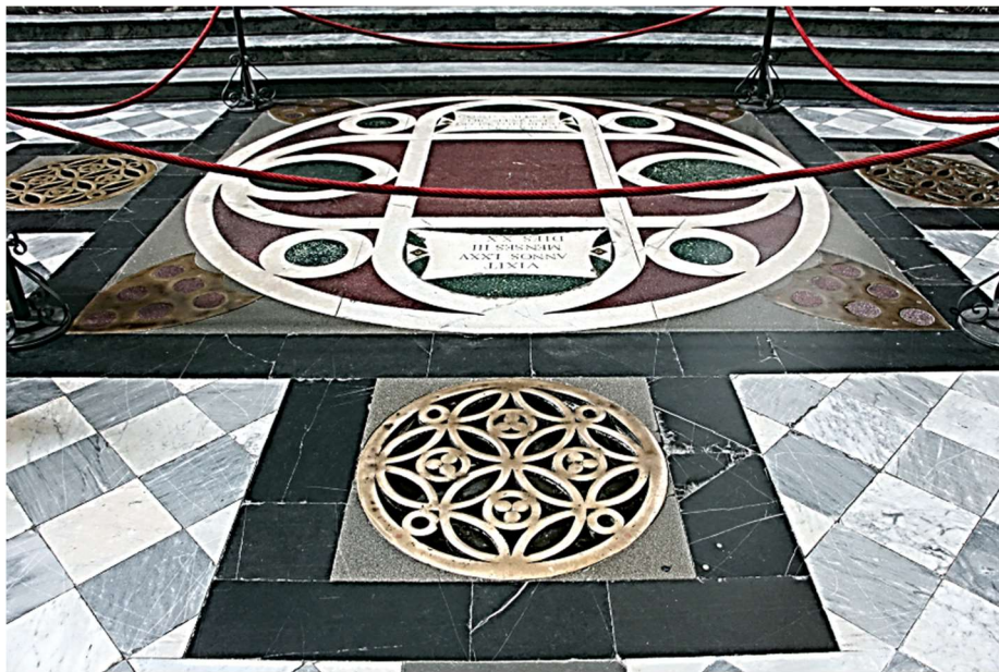
Fig. 12 The upper part of the tomb, with the inscription, presented as a tabula ansata , datable to after 1530 in regular sixteenth-century capitals.

The upper, sixteenth-century inscriptions are again eminently classicising in form, COSMVS MEDICES // HIC SITVS EST // DECRETO PVBLICO // PATER PATRIAE (Cosimo de' Medici lies here, by public decree, father of his country) and VIXIT // ANNOS LXXV // MENSES III // DIES XX (he lived for 75 years, 3 months, 20 days). Decreto publico might refer either to the classical burial formula hic situs est , reminiscent of Pompey's tomb, among others, or to pater patriae , a hallowed Roman title accorded to such heroes as Camillus and Cicero, and which the state bestowed upon the late Cosimo in 1465. 32 It is no wonder that the title should have been eliminated after the first overthrow of the Medici. 33