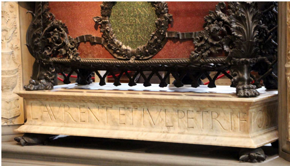
Fig. 14 Detail of the tomb in the Cappella delle reliquie .

The formula-wise eminently classicising upper inscription on the side towards the Cappella delle reliquie is placed in a round shield of serpentine marble with an oak wreath in bronze. The spacing is again relatively regular, and the lettering presents traditional capitals with attempt at shading and devoid of serifs: PETRO // ET IOHANNI DE // MEDICIS // COSMI P(atris) P(atriae) F(iliis) // H(oc) M(onumentum) H(aeredem) N(on) S(equetur) (To Piero and Giovanni de' Medici, sons of Cosimo father of his country. This monument will not go to the heir). 36 The inscription running round the white marble base is palaeographically somewhat nearer to the new, Northern style, in classicising capitals with an attempt at shading but still without serifs: (1) LAVRENT(ius) ET IVL(ianus) PETRI F(ili) (2) POSVER(unt) (3) PATRI PATRVO QVE (4) MCCCCLXXII [Lorenzo and Giuliano sons of Piero erected (this monument) to their father and uncle in 1472].