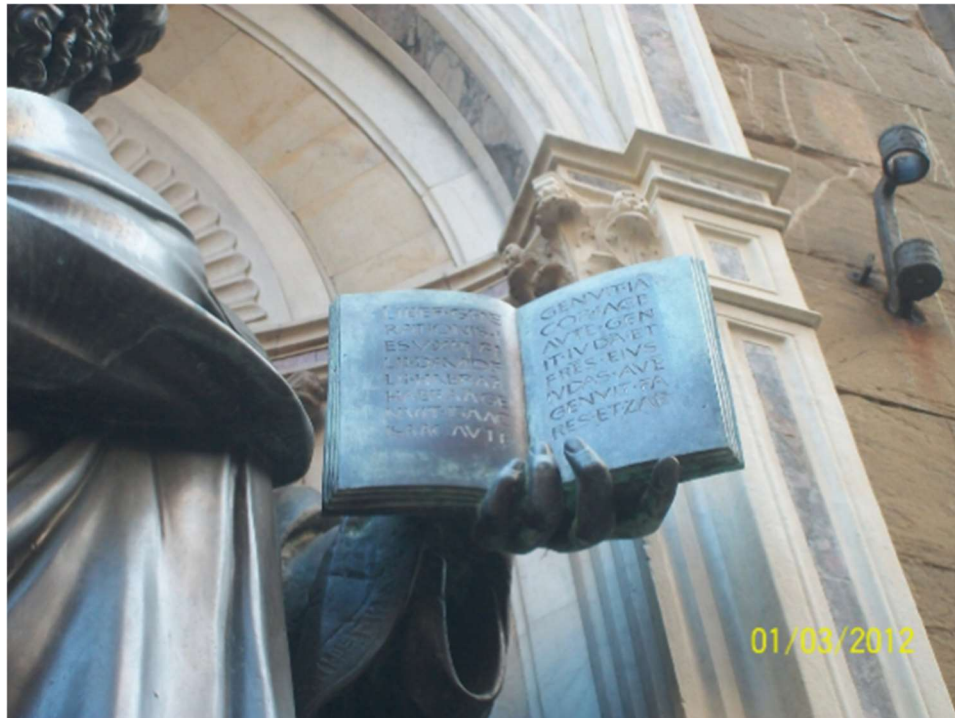
Fig. 1 Ghiberti (1378-1455), St John the Baptist. Florence, Orsanmichele, 1419-1422. Note the absence of shading.

tablets, such as Ghiberti's statue of St John the Baptist outside the church of Orsanmichele, datable to c. 1412-1416 (Fig. 1). 2 Generally, the models of early fifteenth-century Florentine inscriptions are mediaeval, not ancient, as regards the often somewhat irregular spacing, very weak shading and the morphology of the letters, especially the absence of serifs (Fig. 1). Just as the antiqua script developed on the basis of late Carolingian minuscule, the capitals used in monumental contexts were of Carolingian inspiration (Figs 1 and 2). As in humanist texts in general, there was a gradual adoption of ancient dating ( Kalendae, Nonae, Idus ), ancient formulae and terminology ( papa > pontifex maximus etc.) (Figs 2 and 3, still with papa ).