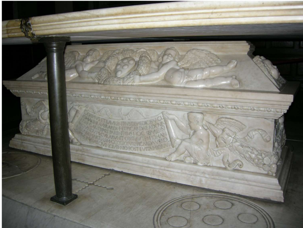
Fig. 6 The sarcophagus of Giovanni di Bicci and Piccarda di Edoardo. Inscription in prose on a parchment roll held by putti.

The sarcophagus presents two inscriptions, the one in prose providing biographical data on the committents and the deceased, and another in elegiac couplets with the funeral poem proper. Both the prose inscription, 13 on a parchment roll held by putti, just as in the epitaph to John XXIII (Figs 2 and 3), and the one in elegiacs, 14 inscribed on a Classicising tabula ansata also held by putti, 15 present the same kind of capitals without serifs but an attempt at shading by thickening of strokes (Fig. 1). The oblique strokes of M do not