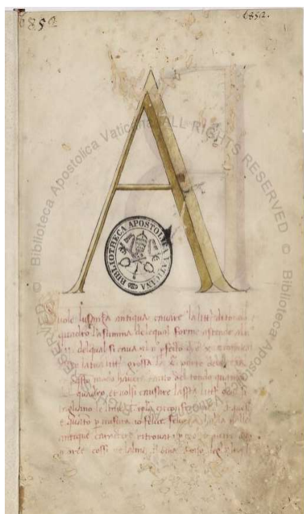
Fig. 9 Felice Feliciano, Vat.lat. 6852, f. 1.

in manuscripts and inscriptions but also in paintings featuring display texts by Mantegna, Giorgio Schiavone (c. 1433/36-1504) and their teacher, Francesco Squarcione (c. 1395 - after 1468), among others. 22 The antiqua script takes a new form, with a writing angle of 90 degrees instead of the slightly right-inclined Florentine version. A new cursive, the italica , also makes its appearance. In addition, the Roman Augustan-era geometrical capitals are restored, just as are largely ancient abbreviations. 23 Around 1460, Felice Feliciano wrote a short Italian-language manual on how to proceed in creating the geometrical forms and shading, transmitted in Vatican City, BAV, Vat.lat. 6852 (Fig. 9). 24 The new script is disseminated in Rome in particular by Bartolomeo Sanvito (1437-1511) from the early 1460s onwards. 25 The Florentine model was finally eliminated by the 1480s. Print characters were to derive from the Northern antiqua , the italica and the restored Classical capitals.