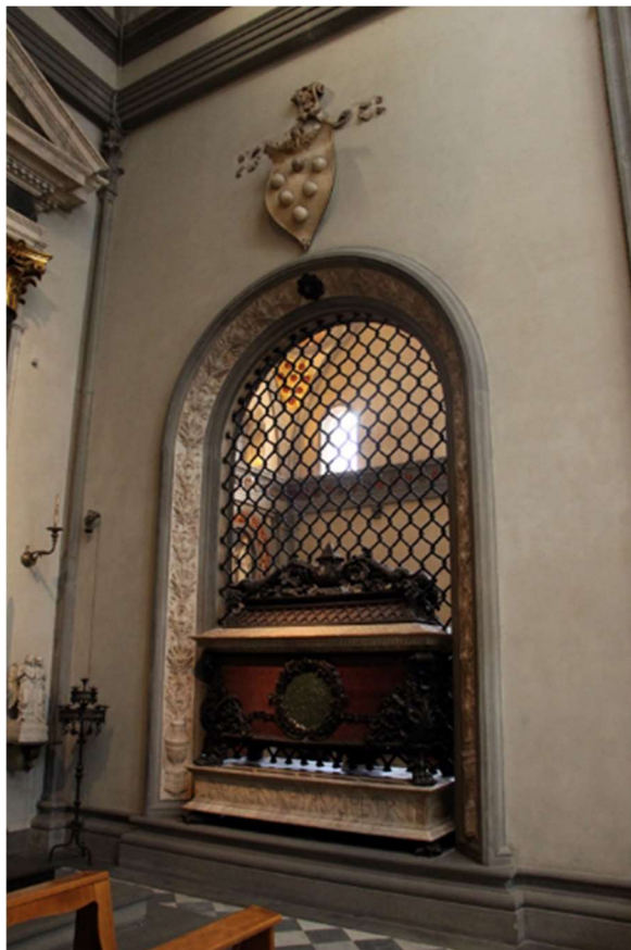
Fig. 13 Piero and Giovanni di Cosimo's tomb.

The monument to Cosimo the Elder's sons, Piero and Giovanni, was also designed by Andrea del Verrocchio 1469-1473 and placed in the wall between the Cappella delle reliquie (or the chapel of Saints Cosmas and Damian) and the Sagrestia Vecchia , and consequently highly visible. 34 Again, typically for Andrea, the monument is multi-coloured with porphyry, white and green serpentine marble as well as elements in bronze. 35 There are inscriptions on both sides. Palaeographically, the monument harks back to the Florentine tradition, although with some elements possibly pointing to awareness of the new, Northern style.