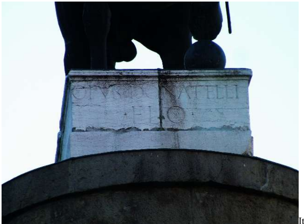
Fig. 8 Donatello, monument to Gattamelata. Padua, Piazza del Santo (post 1447-ante 1453).

pedestal of his statue of Gattamelata in Piazza del Santo of Padua, OPVS DONATELLI .FLO(RENTINI) (Work of Donatello the Florentine), datable to 1447-1453, exhibits fully-fledged Augustan-type capitals geometrically designed and complete with shading, a significant departure from the lettering previously used in monuments designed by him. 19