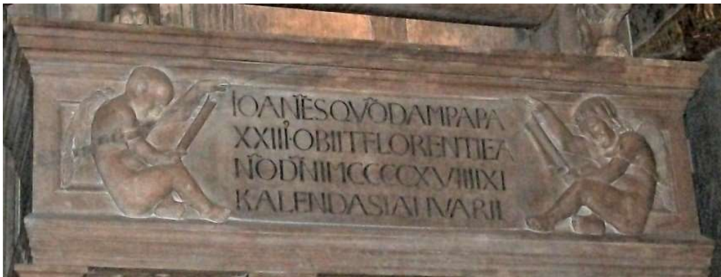
Fig. 3 Epitaph to anti-pope John XXIII. Florence, Baptistery. Note the absence of serifs and the use of Roman dating combined with mediaeval formulae: A(n)no D(omi)ni MCCCCXVIII XI Kalendas Ianuarii (In the year of the Lord 1418, on 22 December).