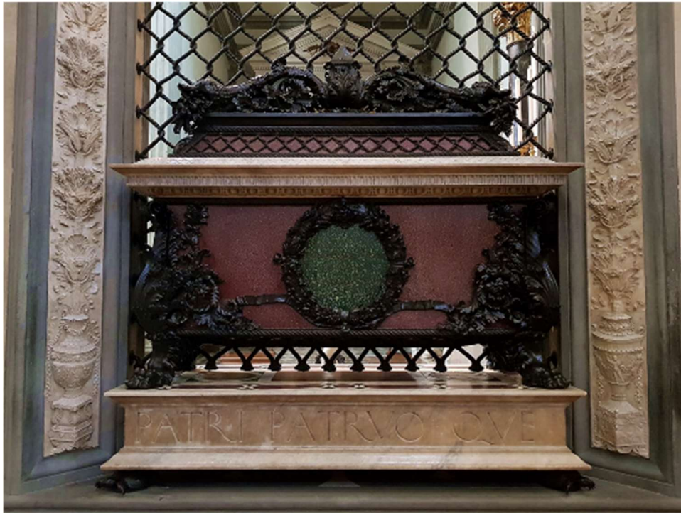
Fig. 15 The tomb from the Sagrestia vecchia side.

The upper, formula-wise classicising inscription is again placed in a round shield in serpentine marble with an oak wreath in bronze: PET(rus) VIX(it) // AN(nos) LIII M(enses) V D(ies) XV // IOHAN(nes) // AN(nos) XLII M(enses) IIII // D(ies) XXVIII (Piero lived for 53 years, 5 months, 15 days, Giovanni 42 years, 4 months, 28 days). The spacing is relatively regular, and the lettering consists of traditional capitals with attempt at shading, again without serifs. For the base, see above, (3) and (4).