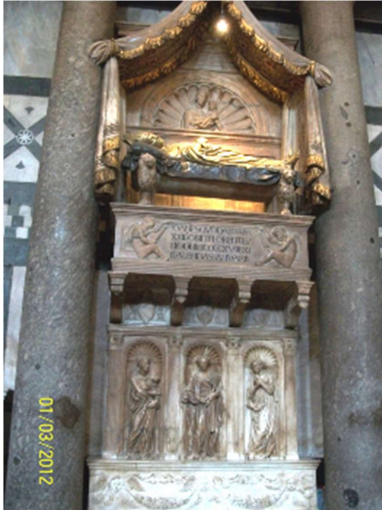
Fig. 2 Donatello (c. 1386-1466) and Michelozzo (1396-1472), Epitaph to anti-pope John XXIII (1425-27) Florence, Baptistery.