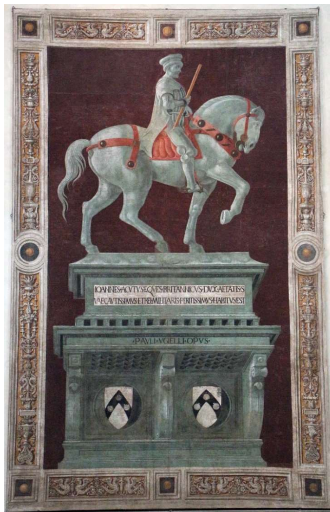
Fig. 4 Paolo Uccello, John Hawkwood. Fresco. Duomo, Florence. Photo Sailko. CC BY 3.0. Public domain

The monumental use of inscriptions in capitals all'antica strongly develops from the beginning of the 1430s onwards, on stone, metal and in frescoes. Both Michelozzo (inscriptions) and Paolo Uccello (1397-1475), whose 1436 fresco representing an equestrian statue of the condottiero John Hawkwood aka Giovanni Acuto (c. 1323-1394) in the Duomo of Florence sports an inscription in relatively regular, serified monumental capitals (Fig. 4), contribute to this development.